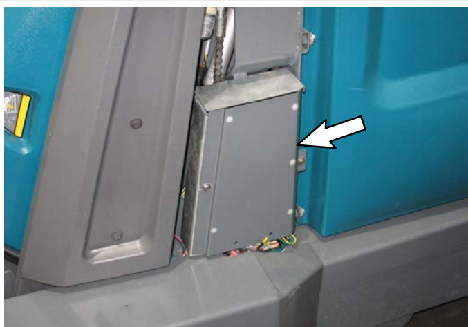
FIG. 1 - Sweep Circuit Board Located Inside Electrical Enclosure On Electrical Enclosure Cover

NOTES: 1. Check sweep board revision number. The sweep board should be labeled revision 01. Machines above serial number M17- 10293 already have this circuit board installed. Replace sweep board if it is labeled revision 00 (machines serial numbers below M17- 10293). (Fig. 1 / Fig. 2) If a new Sweep Board is required, order Circuit Board Kit, Swp, Side, Afmkt [M17] - Kit Number 9015048. The IB for this kit is IB 9015110. 2. Use Service Diagnostic Tool to check software revision. If necessary, update to latest software revision. 3. Check if vacuum fan static harness / fan guard are installed. Machines above serial number M17- 10271 already have the vacuum fan static harness / fan guard installed. Install vacuum fan static harness kit onto machines serial numbers below M17- 10271. (Fig. 3) Note: Machines serial numbers M17- 10240 through M17- 10271 may have an incorrectly installed static harness. If this harness is installed, and is not connected directly to a thread roller in the frame (connected to the hopper down switch bracket instead), it should be replaced. If a vacuum fan static harness / fan guard are required, order Harness Kit, Vac Fan, Afmkt [Static Ground] - Kit Number 9015386. The IB for this kit is IB 9015386 9015268 Questions, contact the Tennant Customer Service Department at (800) 553- 8033 or (763) 513- 2850. Warranty Information: Standard terms apply.