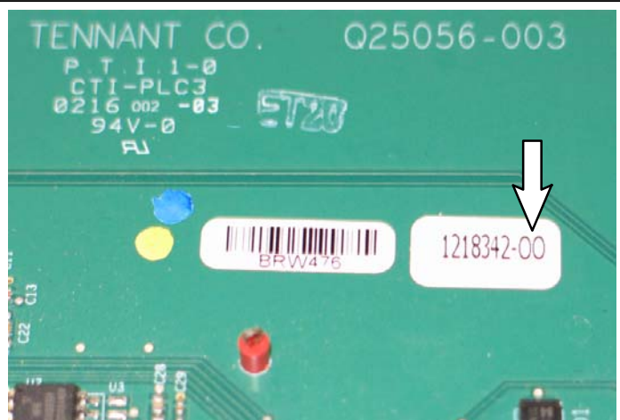
FIG. 2 - Sweep Circuit Board Revision Number Location