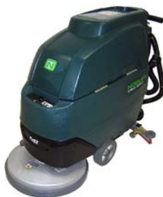
Speed Scrub 17/20/24 (SS3)

Replace control board module with Revision 03.