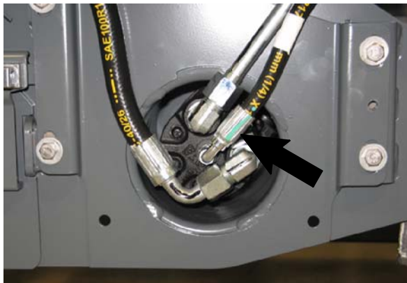
Install additional fitting on to front brush motor

Warranty Information: Recommended Update. Standard Terms Apply.